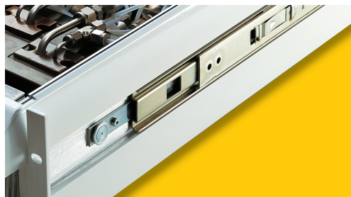
The CLD 822 S hr with slides is perfectly prepared for rack mounting

The concept with two parallel reaction chambers allows the simultaneous measurement of NO and NO x in order to generate the precise value of NO 2 .